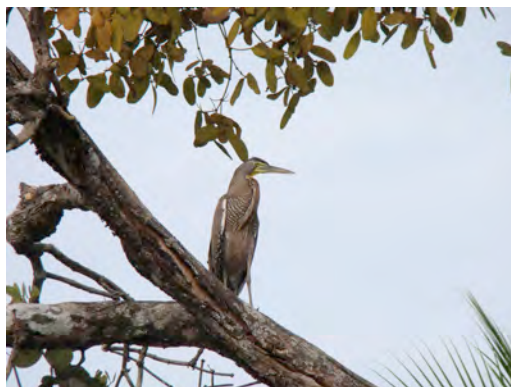
A bare-throated tiger heron along the Rio Sierpe, Costa Rica.

I hope you're geared up for an eventful winter. This is the time of year to be planning your summers. Many professional-development opportunities have early application deadlines, so keep an eye out for something to do. Try to take advantage of these wonderful conferences, workshops and more. Keep reading for unique events and ideas for educators. There is a lot going on in North Carolina and beyond!