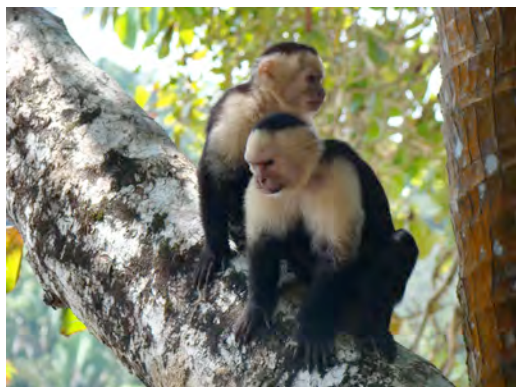
These white-faced capuchins at Manuel Antonio came out to see us.

Speaking of warmth and beaches, I spent the holidays exploring Costa Rica. Here are a couple of my photos from our adventures down south.