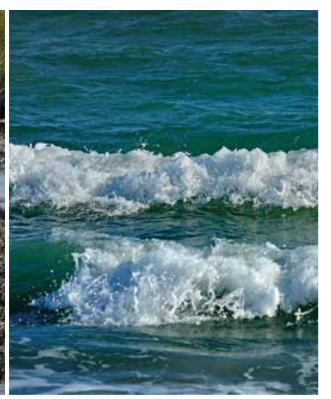
Commercial and Recreational Fisheries | Coastal Storms and Impacts | Shoreline Management