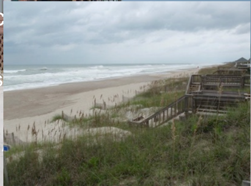
Nice Day in Nags Head, NC