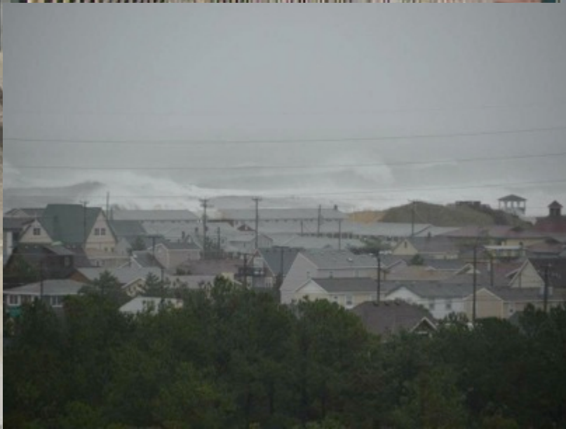
Superstorm Sandy – Kitty Hawk, NC