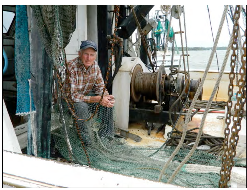
Davis Seafood, Sneads Ferry, North Carolina

The majority of those with improved sales took part in one or several of the abovementioned strategies: retail sales, value-added products, state and regional "wild-caught" branding programs and advertisements, and Internet and social media. Other strategies included offering customers recipes with their purchase and playing educational seafood videos in their retail store. Many pointed out that those with the "right" permits, namely sea scallop permits, were most successful. One wholesaler, for example, was able to expand his business due to the high value of sea scallops, and planned to open a restaurant that featured local seafood. One of the largest seafood companies in North Carolina expanded to a global scale years ago with a presence in Europe and South America, and attributed its success to "the Good Lord" and having a presence on the global stage.