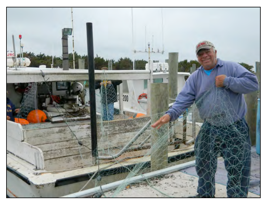
Working Waterfront in Hatteras, North Carolina

respondents indicated a willingness to participate in any future research that would determine the economic value and significance of the seafood industry to North Carolina.