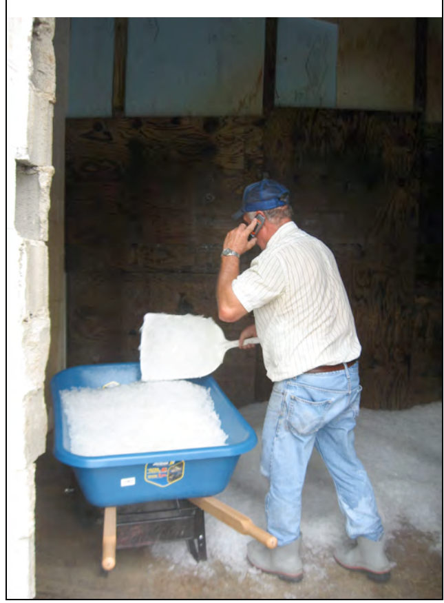
Quality Seafood, Cedar Island, North Carolina