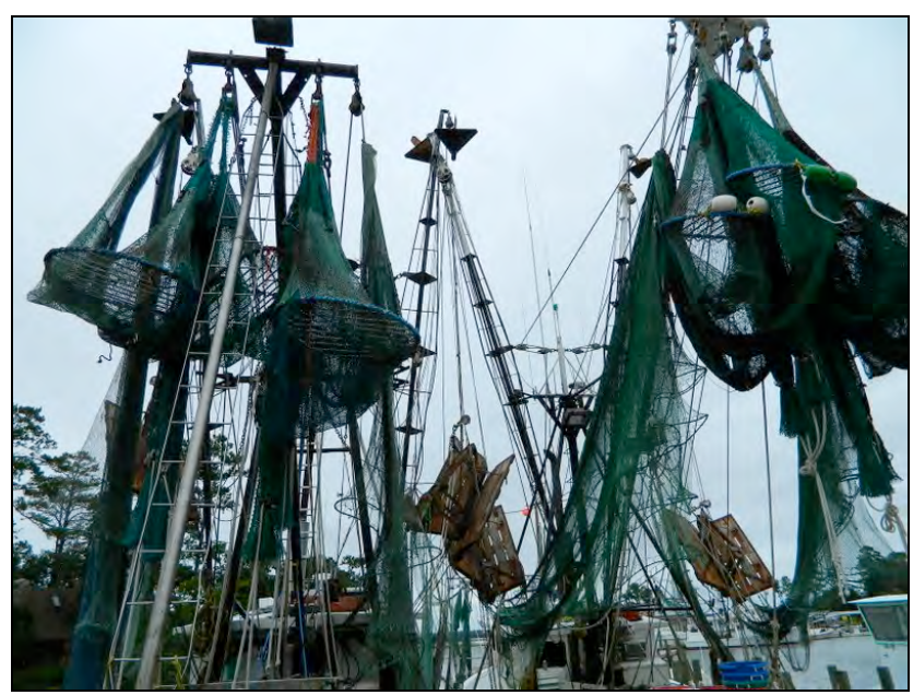
Shrimp Trawl Gear