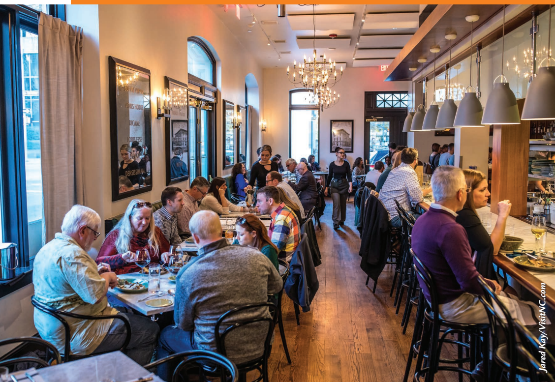
A WIDE VARIETY OF RESTAURANTS AND OTHER RETAILERS HAVE CARRIED FARM-FRESH STRIPED BASS, INCLUDING RALEIGH'S "DEATH & TAXES" (ABOVE, PRE-PANDEMIC).