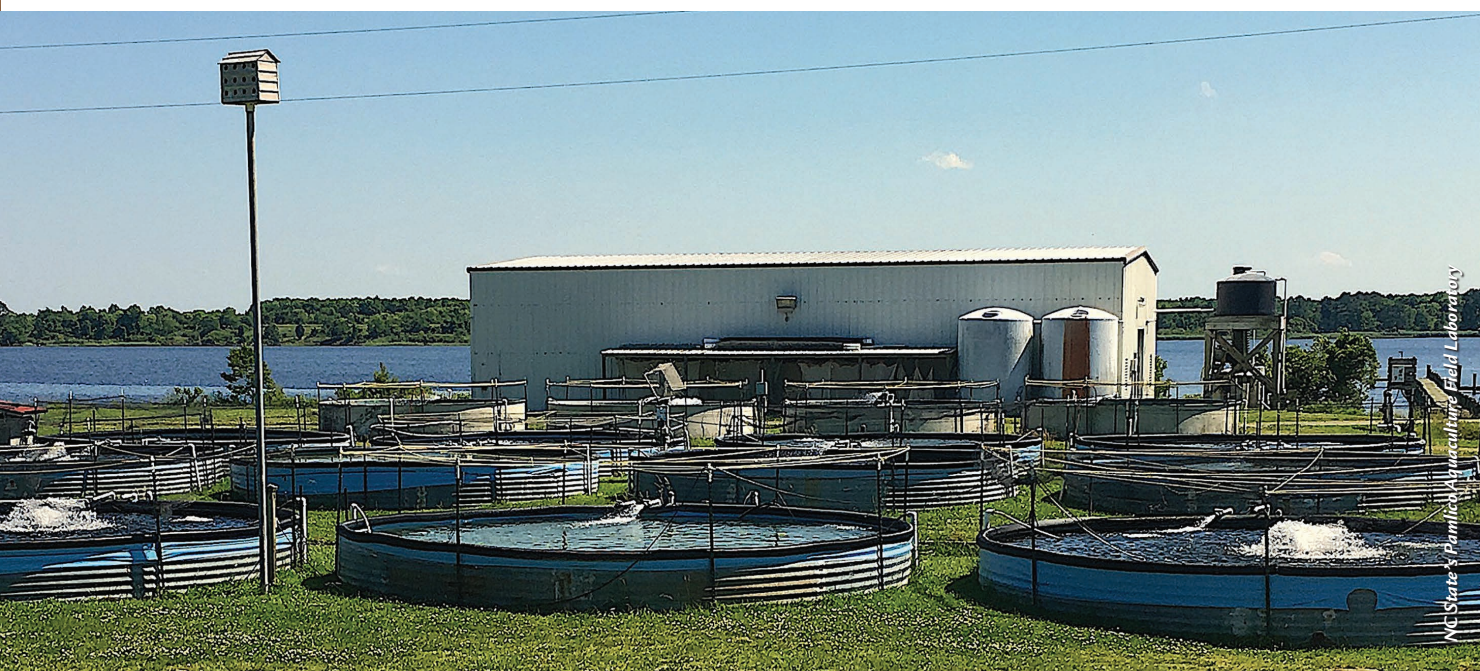
SINCE THE 1980S, SCIENTISTS HAVE BEEN DOMESTICATING HYBRID STRIPED BASS AND STRIPED BASS AT THE PAMLICO AQUACULTURE FIELD LABORATORY IN AURORA, NORTH CAROLINA.