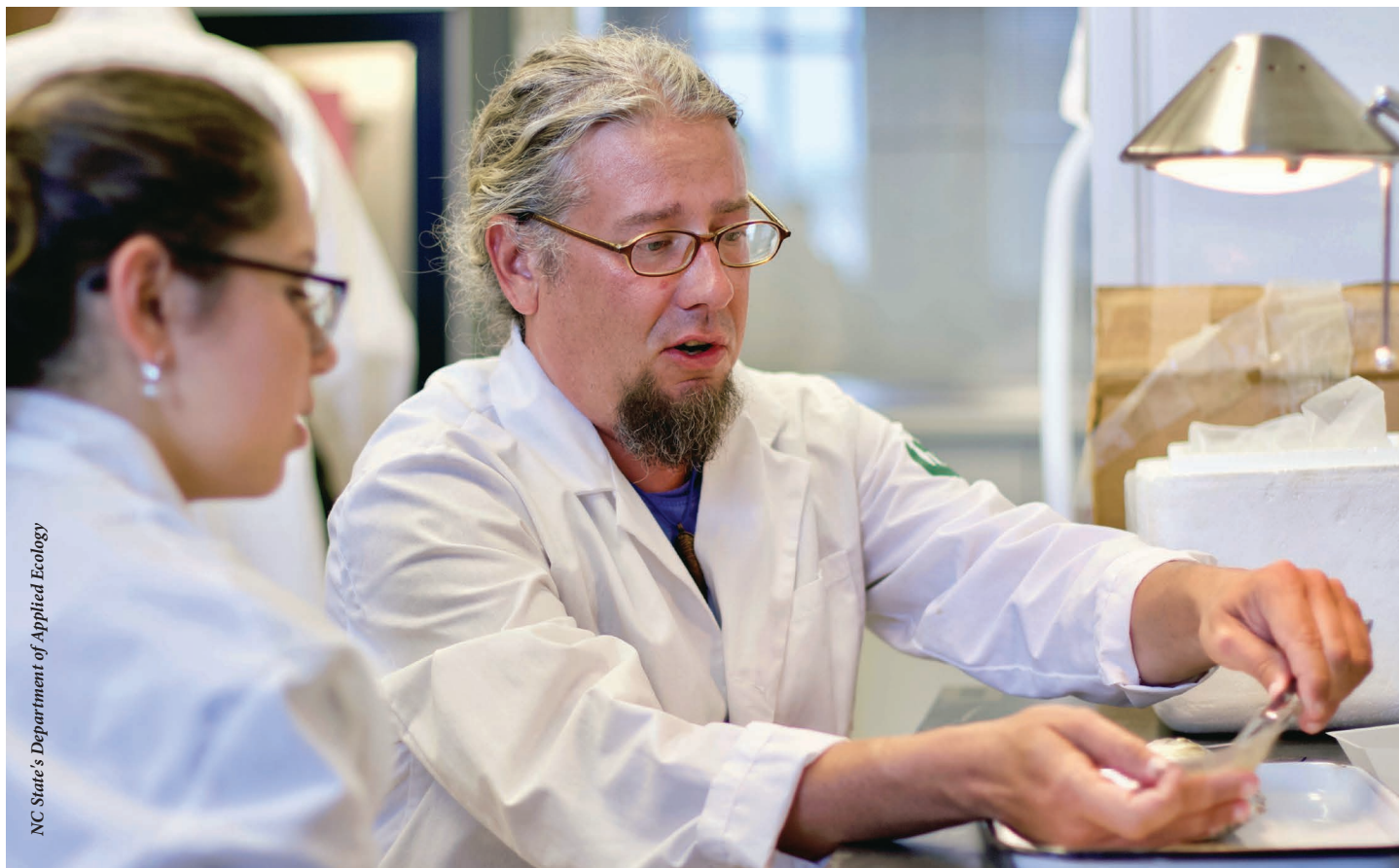
NC State's Department of Applied Ecology