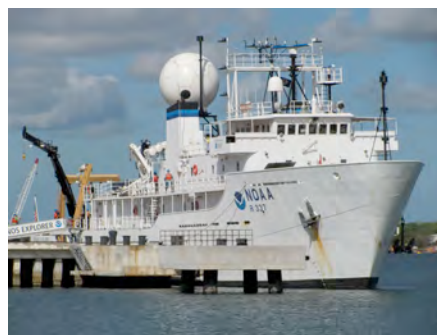
NOAA Ship Oceanos Explorer berthed in Pearl Harbor, Hawaii.

To register, visit reservations.ncaquariums.com/pineknollshores/Info.aspx?EventID=1010 .