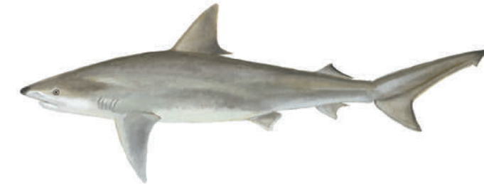
5 Blacknose ( Carcharchinus acronotus )