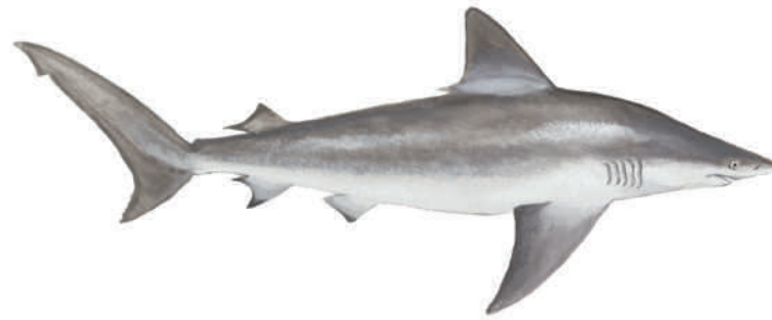
1 Sandbar shark ( Carcharhinus plumbeus )