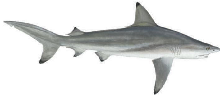
3 Blacktip ( Carcharhinus limbatus )