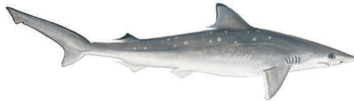
2 Sharpnose ( Rhizoprionodon terraenovae )