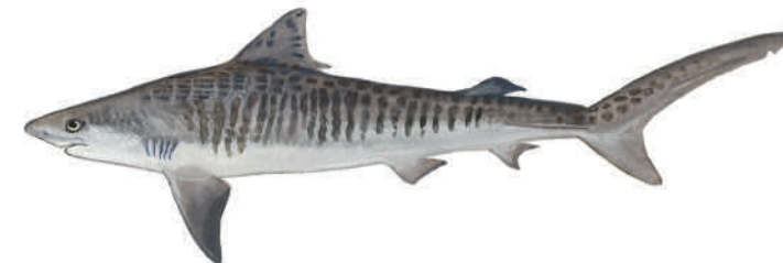
7 Tiger ( Galeocerdo cuvier )