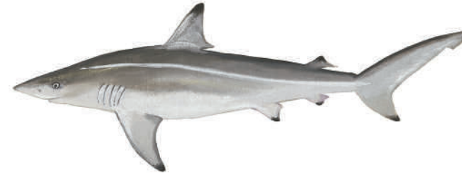
4 Spinner ( Carcharhinus brevipinna )