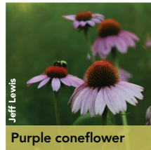
Jeff Lewis Purple coneflower