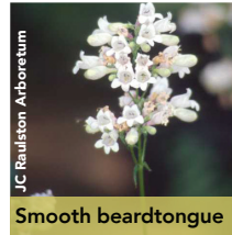
J.C. Raulston Arboretum Smooth beardtongue