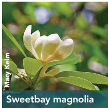
Mary Keim Sweetbay magnolia

SUN: ☀️ ☂️ WATER: 💧 SEASONAL COLOR: APR-OCT