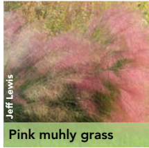
Pink muhly grass