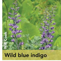
Wild blue indigo