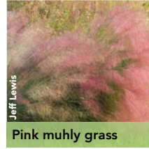
Pink muhly grass